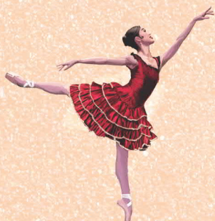
Ruffled flamenco skirt