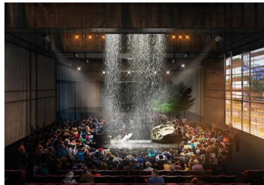
Artist impression of the new waterfront theatre, for illustration purposes only.

SINGAPORE, 18 December 2017 – Esplanade – Theatres on the Bay is pleased to appoint a Multidisciplinary Team of consultants to develop and construct its new mid-sized theatre situated along its busy waterfront. The Team is led by an established Singapore architectural firm, architects61 and comprises one of the world’s leading theatre, acoustics and digital design consultancy firm, Charcoalblue (UK, USA and Australia). The team was selected after a stringent and rigorous two-stage tender process which began in August 2017.