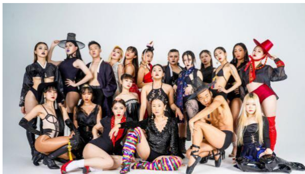
House of Love

1 & 2 Dec 2023, Fri & Sat, 8pm Esplanade Theatre