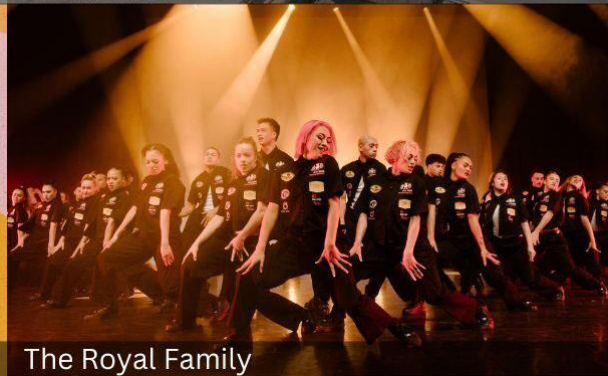
The Royal Family

Get ready to be blown away by FULL OUT! 2023